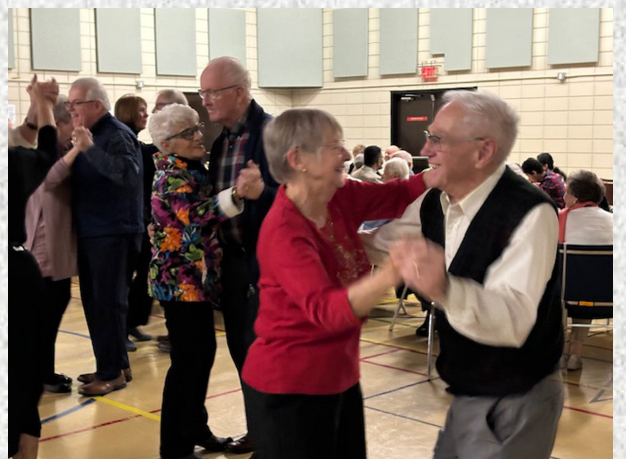
OKTOBERFEST OCT 25/ 2024

The older I get the tighter companies are putting the lids on jars