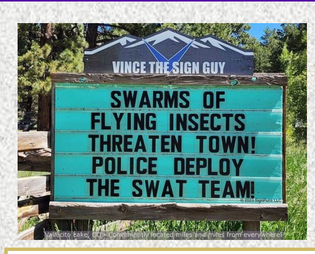
Comments made in 1957

I don't know how to use TikTok, but I can write in cursive, do long division, and tell time on clocks with hands... so there's that. I might not be up to speed with the latest trends, but I can bring some classic skills to the table!